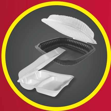
Food or takeout containers