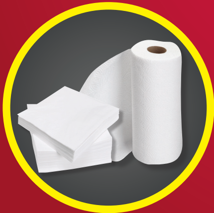
Napkins or paper towels