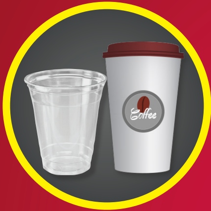
Cups of any kind