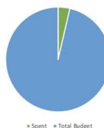
Spending JUL-SEP FY22