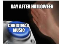
Such is the way of life