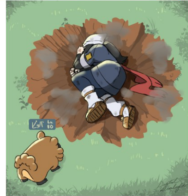
Photo: Me 1 hour into Legends Arceus