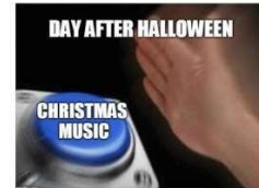
Such is the way of life